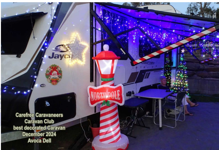
Carefree Caravaneers Caravan Club best decorated Caravan December 2024 Avoca Dell