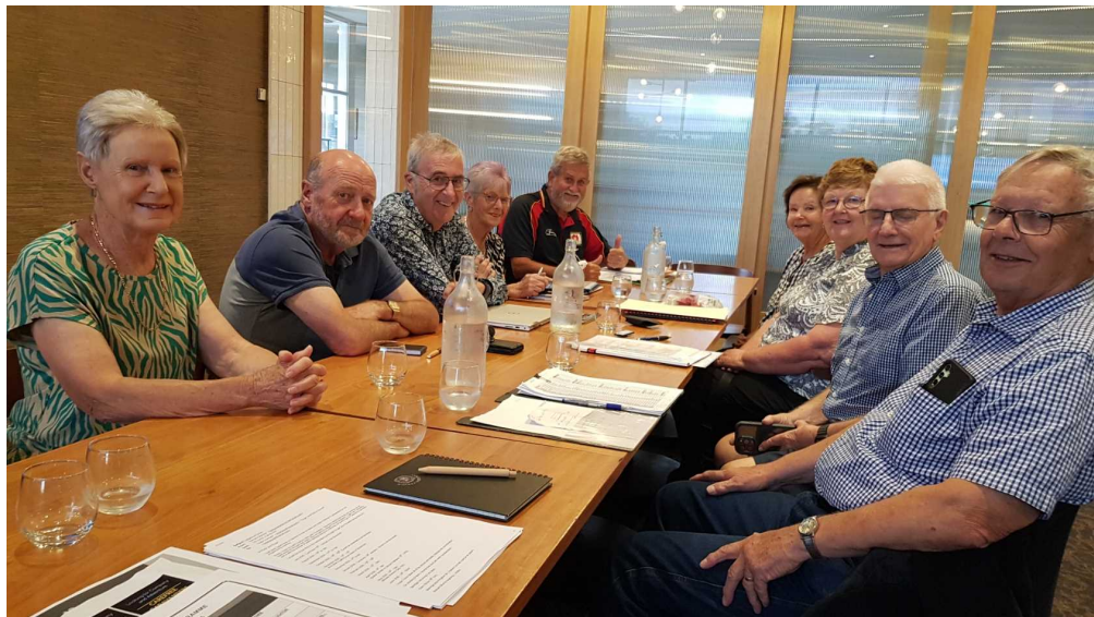
YOUR HARD WORKING COMMITTEE AT WORK. + ONE