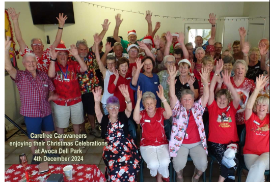
Carefree Caravaneers enjoying their Christmas Celebrations at Avoca Dell Park 4th December 2024